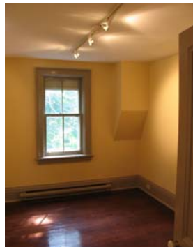
Upper Level (Program Room)