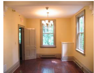
Main Level (Program Room 2) Measurements: 20' (L) x 13' (W)