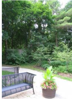
Exterior View: Raised Patio