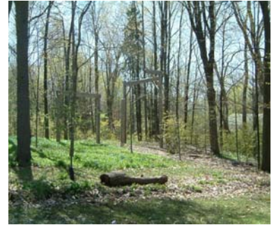
Exterior View: Site of Tangled Garden