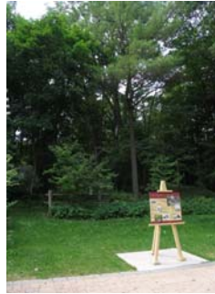
Exterior View: Interpretive Panel