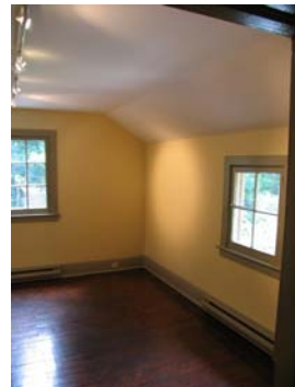
Upper Level (Program Room)