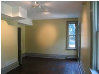
Main Level (Program Room 1) Measurements: 20' (L) x 10' (W)