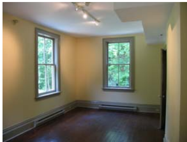
Main Level (Program Room 1) Measurements: 20' (L) x 10' (W)