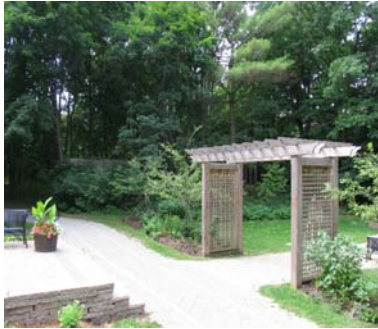
Exterior View: From Back Entrance to Grounds